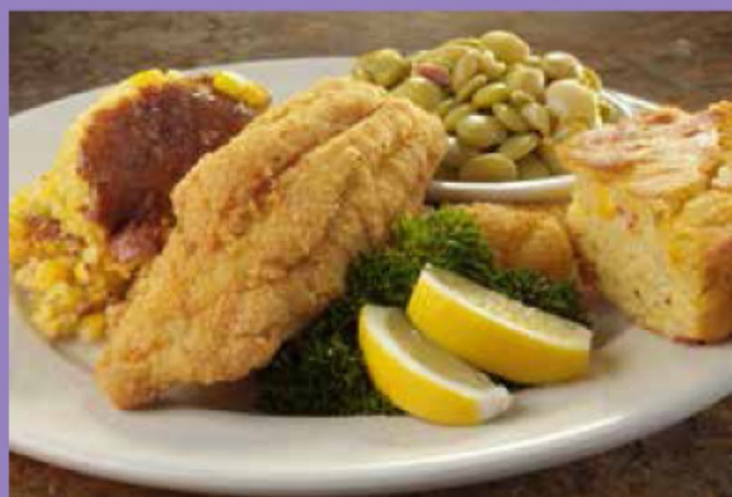
US Farm-Raised Catfish

Fresh Baked Yeast Rolls • Iron Skillet Cornbread Mexican Skillet Cornbread